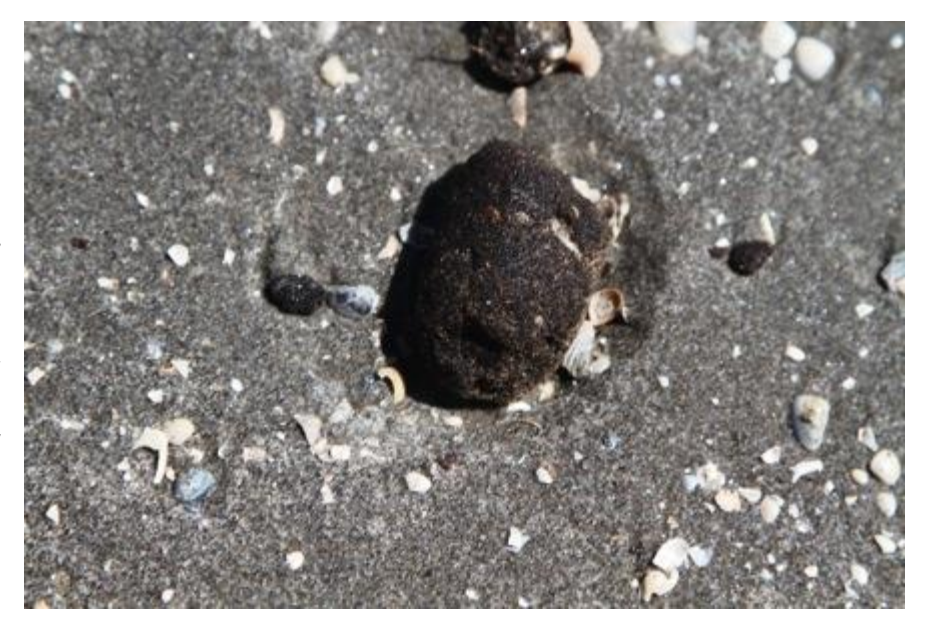
At Elmer's Island, La., one of countless tarballs still washing ashore from the BP/ Deepwater Horizon Oil Disaster in 2010.

On September 2, Lower Mississippi Riverkeeper took samples of suspected BP oil washed up on Fourchon Beach just before it was closed. On September 4, in partnership with Greenpeace. conducted ground surveys of East Ship and West Ship islands, part of the Gulf National Seashore, Islands and Greenpeace sent samples of tar balls suspected to be from the BP oil spill for laboratory analysis. On September 6 Consortium member GRN and their colleagues at Greenpeace surveyed storm damage by boat and documented fresh oil coating the marsh in Bay Batiste in northern Barataria Bay.