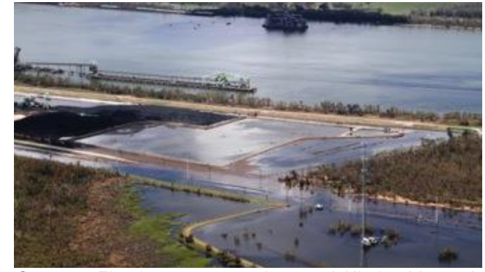
Sept. 2—Floodwaters on and around Kinder Morgan's IMT where containment levees failed, allowing contaminated runoff to escape into the surrounding environment.