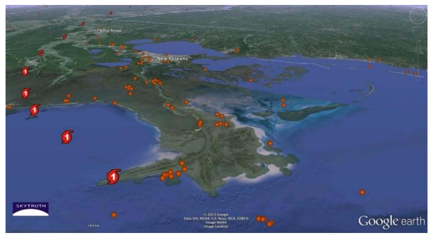
In red, the path of Hurricane Isaac, and in orange, pollution reports received by the NRC between August 28 and September 11, 2012, the dates of the storm and the initial cleanup.

During and following Hurricane Isaac, from August 28 to September 18, 2012, a total of 130 accidents were reported to the NRC as a direct result of the storm; 69 additional reports to the NRC may be related to the storm given the report date and incident type, but these reports did not specifically mention Hurricane Isaac. Of the 130 accidents attributed to the hurricane, 108 reports identified specific pollutants released or suspected to have been released. There were an additional 32 reports not associated with specific pollutants released (e.g., reports of unmarked 55-gallon drums found in storm debris). Of the 108 NRC and LDEQ reports of pollution due to Hurricane Isaac, 45 provided estimates of the amount of specific pollutants released, totaling at least 12,941,044 gallons of pollutants and contaminated water, and over 192 tons of gases released into the environment of the Gulf Coast Region.