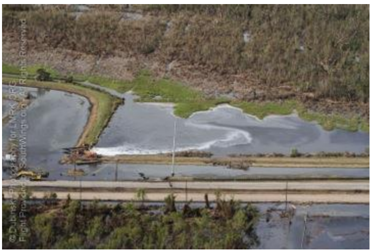
Left: Sept. 2—Flooded Kinder Morgan International Marine Terminals at Myrtle Grove, LA where floodwaters saturate dirty fossil fuels such as coal and petroleum.

Right: Sept. 10— Same facility with floodwaters being pumped out into surrounding waterways.